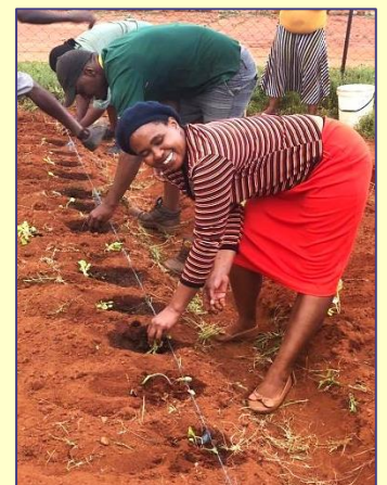
Here are some pictures of places where Maq trained recently. From top to Bottom: Soshanguve; Masakeng near Groblersdal and Zebediela.