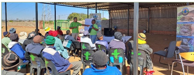
Temba Hammanskraal / Bethlehem Mission: 4-5 June