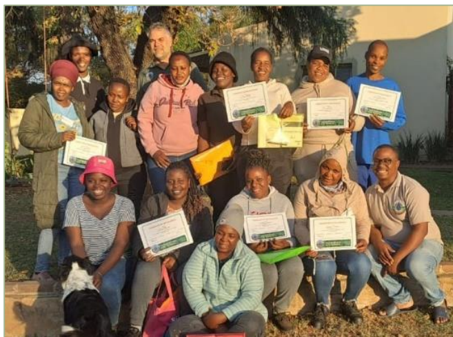
Etz Chayim / Butterfly Foundation: 21-23 May