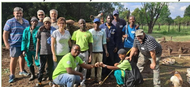
Etz Chayim: 27-29 February