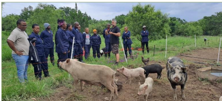
Etz Chayim / EARN Training: 9 January