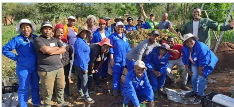
Rhema Rain / Beulah: 25-28 March