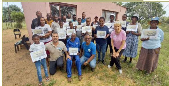
(Above, Left, Below) Last training of the year with Amazing Graces: Nokaneng (Rapotokwane), Mpumalanga. 30Nov - 2 Dec.