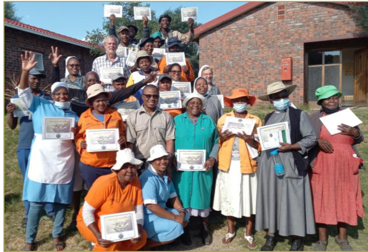
Above and Left: We had a two - year program that ended this year with the people of Assisi Mission in Ladybrand, Free State. 26-28 Jan 16-18 Feb