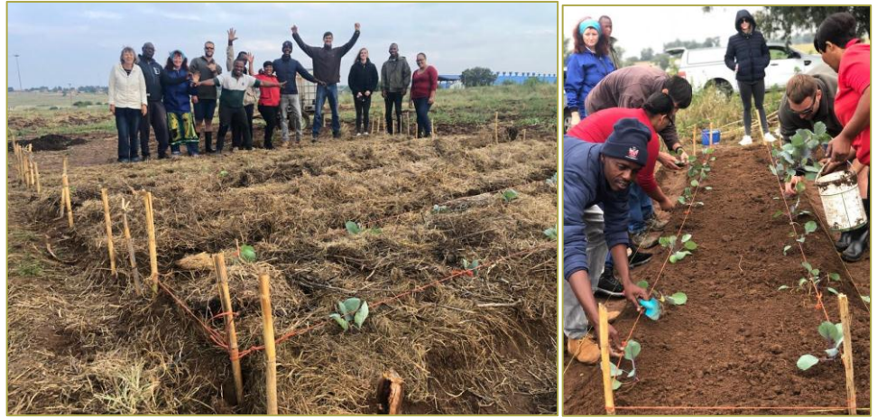
Above: Vredefort, Free State. 23-25 March (Three Day)