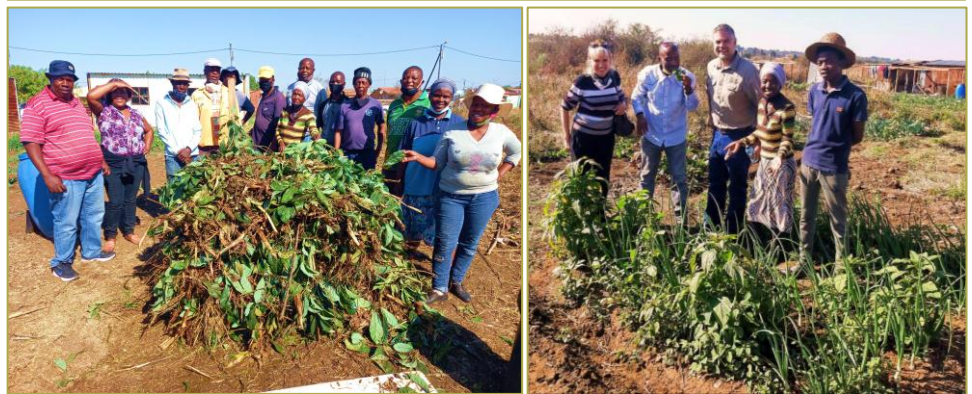
Above: Soshanguve, Gauteng. (With Amazing Graces)