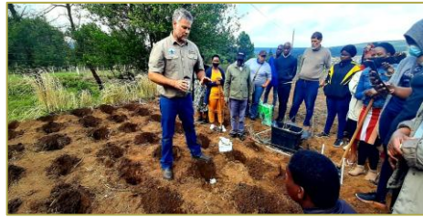
(Above and Left) Greytown, KZN. 5-8 Oct. We trained the biggest group we ever had (42 people), and visited an orphanage on the last day to set up a vegetable garden for them.