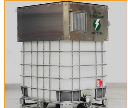
The Green Lightning Machine

monitors your field in real time—diagnosing plant health, water needs, and fertilizer requirements.